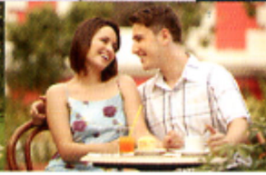
Excellent dining and entertainment choices at The Wharf.