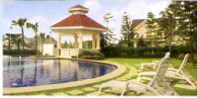
Indulge in the various leisure and lifestyle amenities at Lakefront.