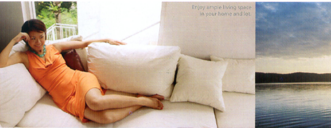
Enjoy ample living space in your home and lot.

M arina Heights gives you a lot more room, a lot more leisure and lifestyle choices that owning a home and lot brings.