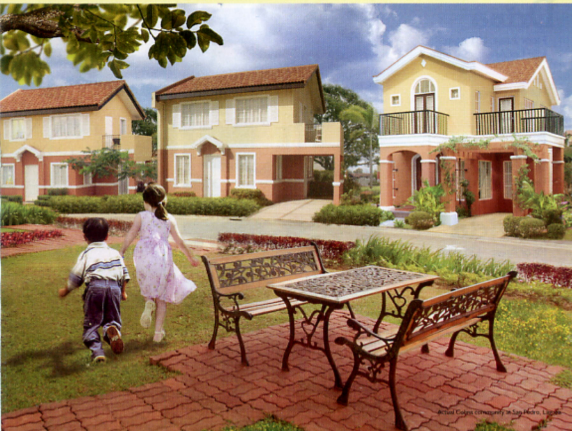
Actual Colina community in San Pedro, Laguna

The space to grow up in, the place to come home to.