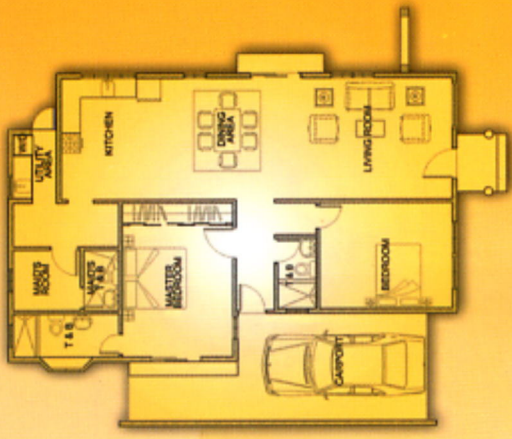
Ground Floor Layout Option B

138 sq. m./ 1,485 sq. ft. 300 sq. m./ 3,229 sq. ft. 13 meters 19 meters